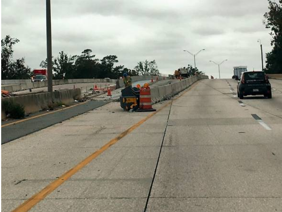
I-95 NB decision point area approaching the San Diego Road overpass.