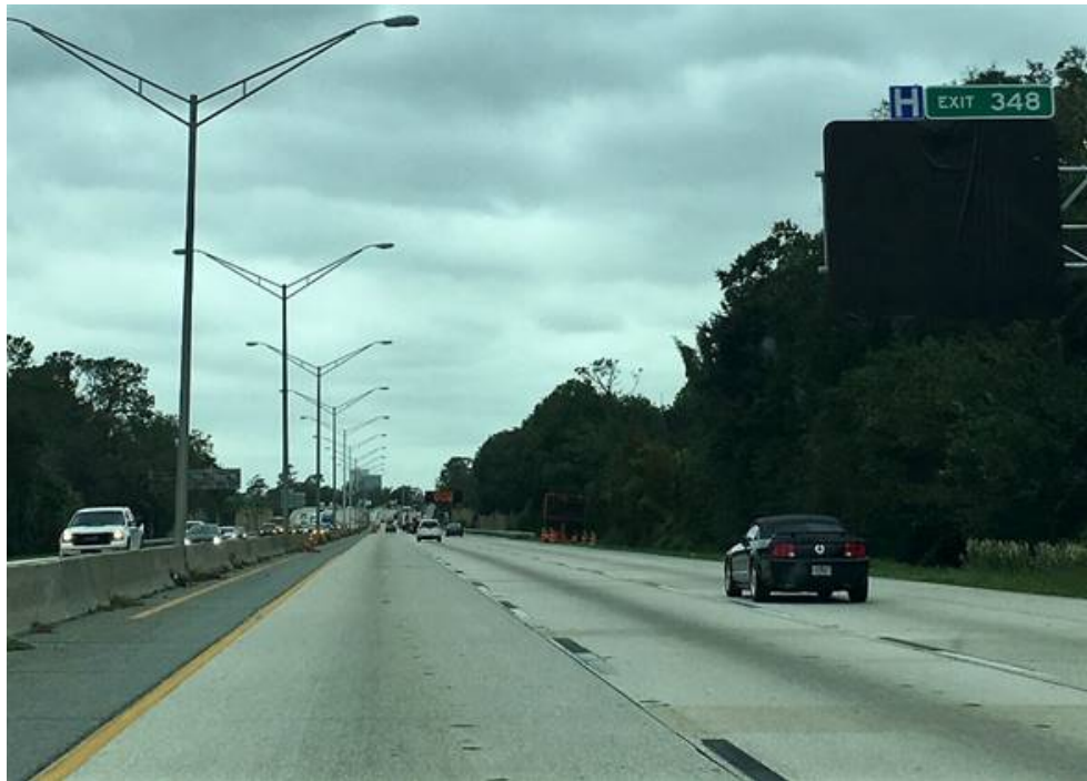
I-95NB approaching decision point area before San Diego Road overpass.