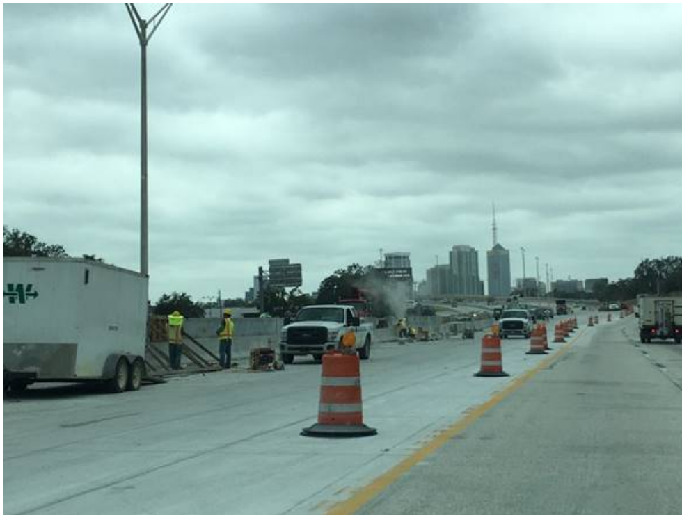
New I-95 NB lanes on left being finalized for traffic shift. Service lanes to downtown are on right.